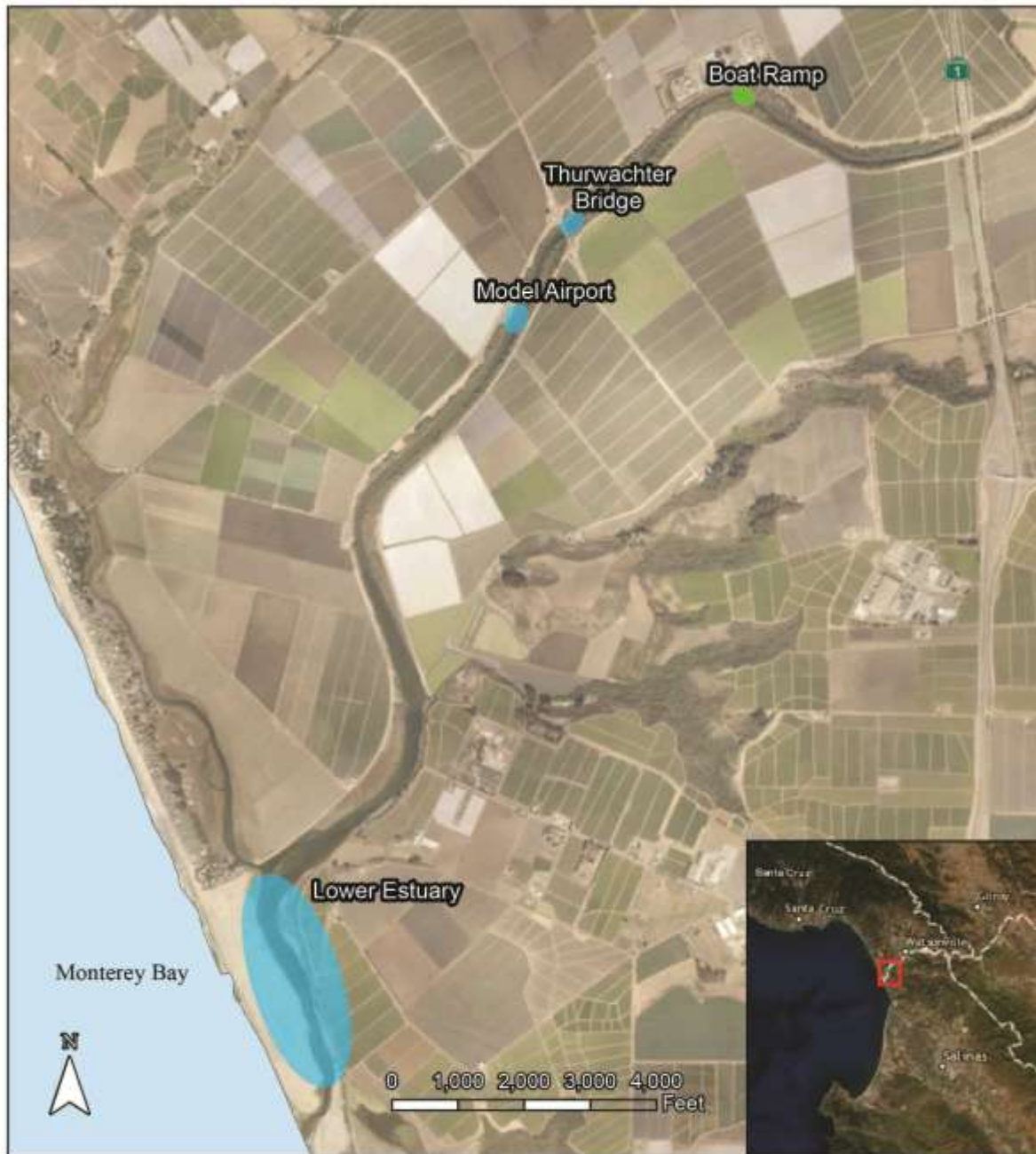
Figure 1. Pajaro Lagoon Fish and Water Quality Sampling Sites