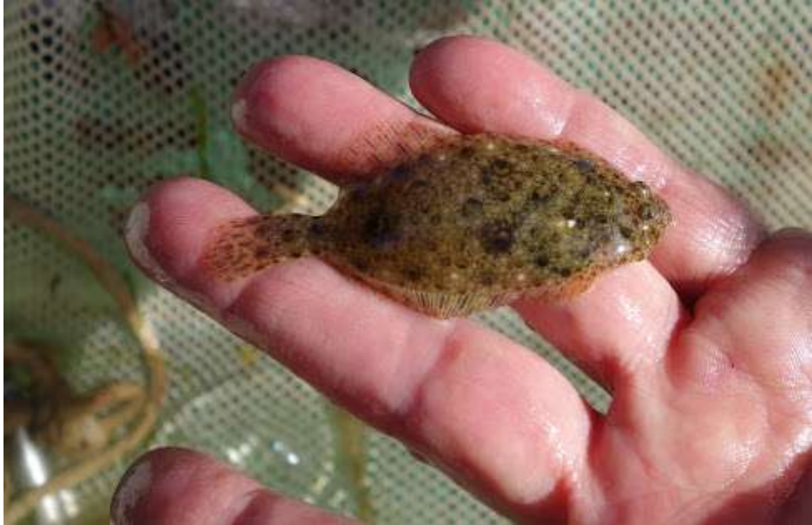
Starry flounder ( Platichthys stellatus ) in Pajaro Estuary. 30 Sep 2019.