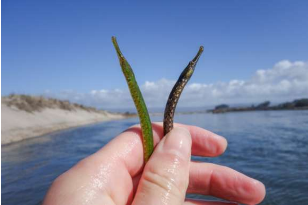
Bay pipefish- two color phases in Pajaro Estuary. 30 September 2019