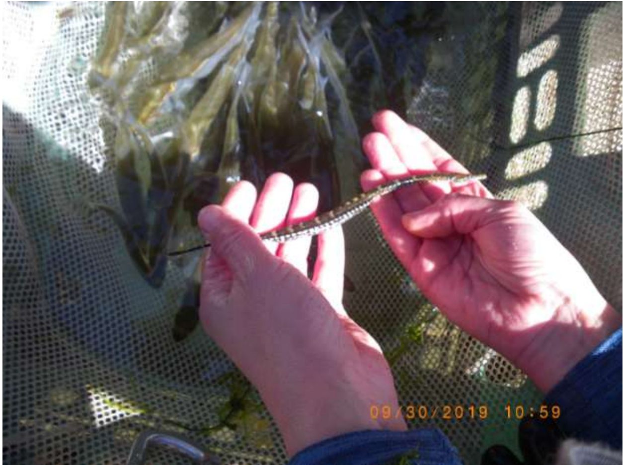
Bay pipefish ( Syngnathus leptorhynchus )