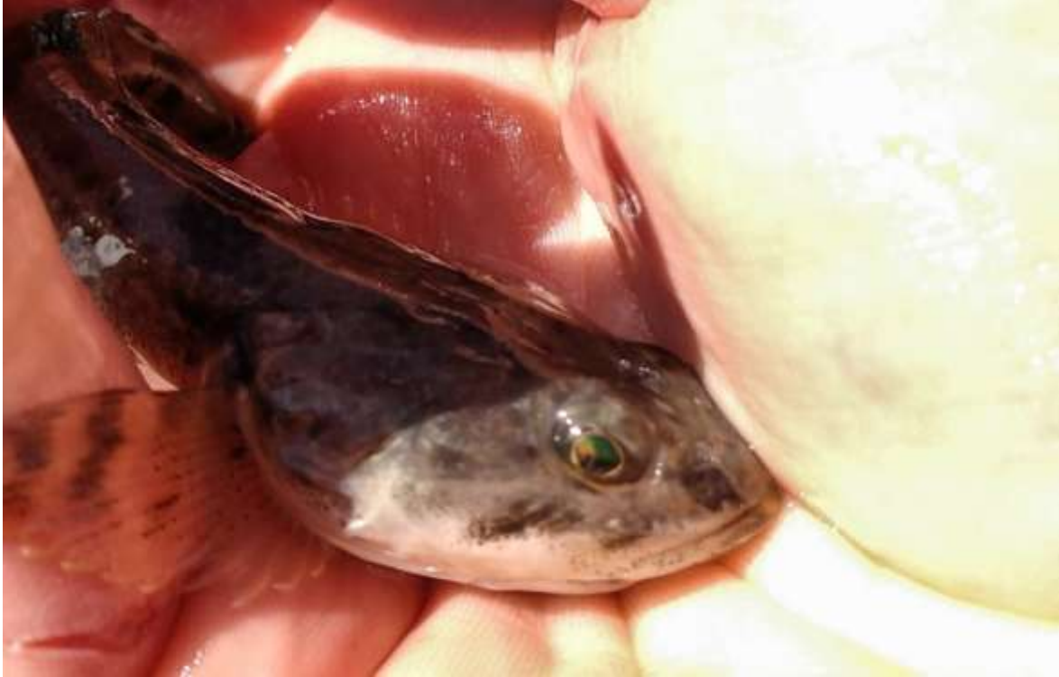
Green-eyed staghorn sculpin ( Leptocottus armatus ) in Pajaro Estuary. 30 September 2019.