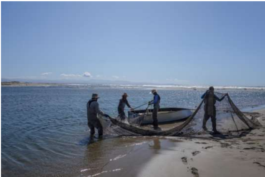
Pajaro Estuary looking southeast, viewing outlet channel bending south (to the right), with the estuary extending further to the east (on left). 30 September 2019