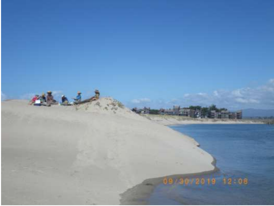
Pajaro Estuary beachfront looking west at lunch time toward Pajaro Dunes Development. 30 September 2019